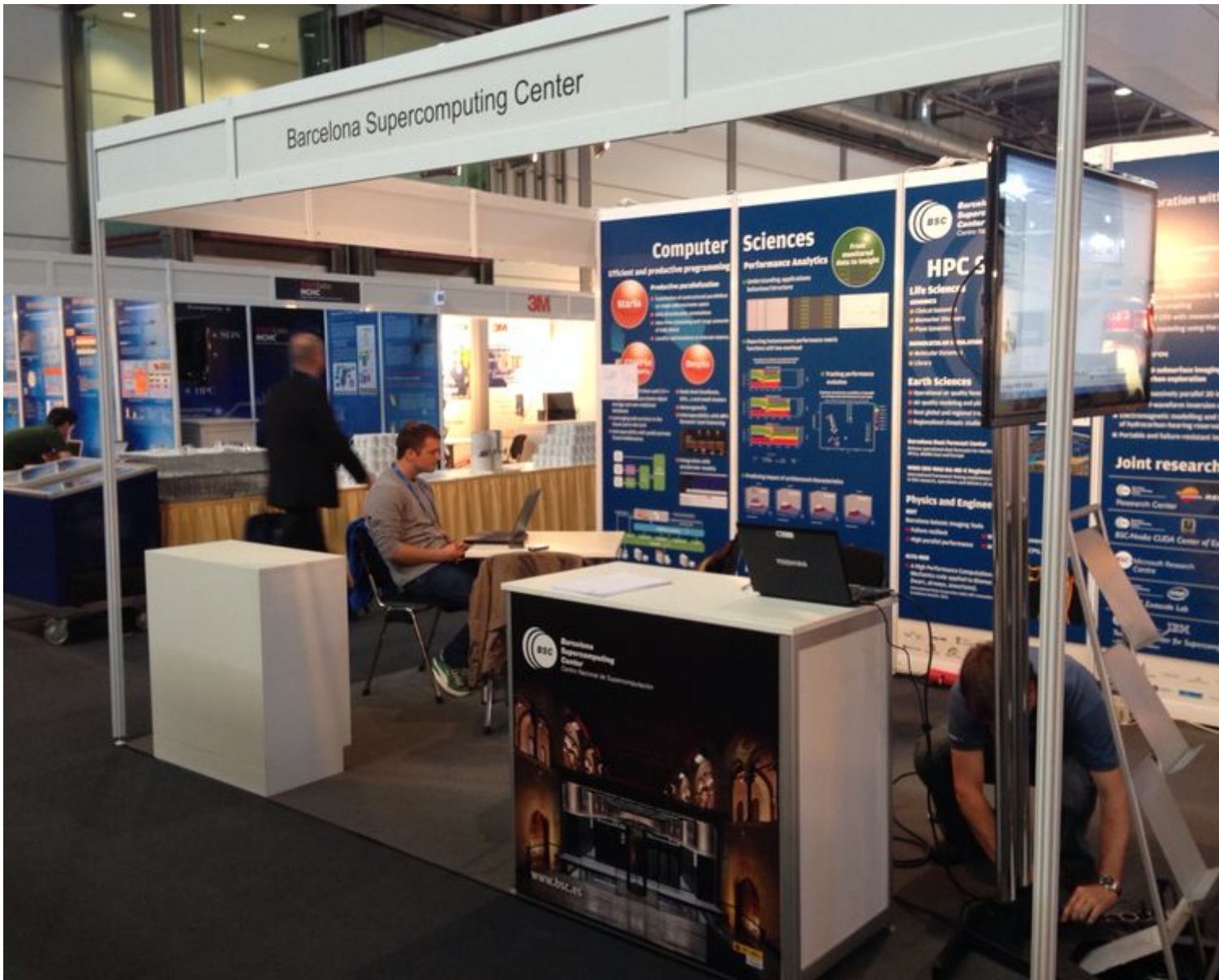
Barcelona Supercomputing Center - Centro Nacional de Supercomputación

Source URL (retrieved on 20 Mar 2025 - 18:28): https://www.bsc.es/es/news/bsc-news/visit-the-bsc-booth-isc%C2%B414-exhibition