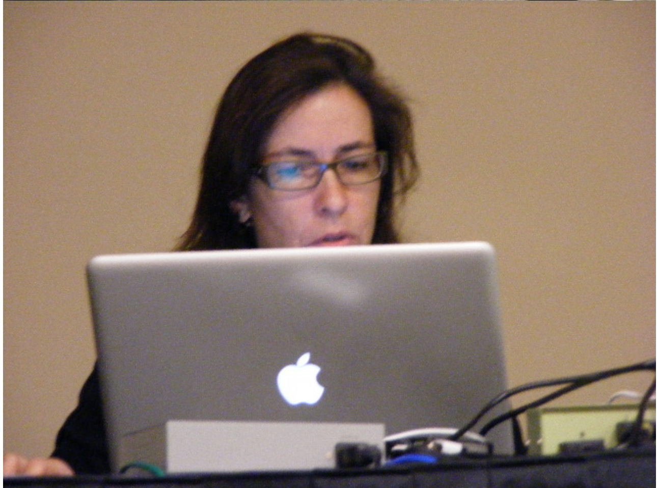
Barcelona Supercomputing Center - Centro Nacional de Supercomputación